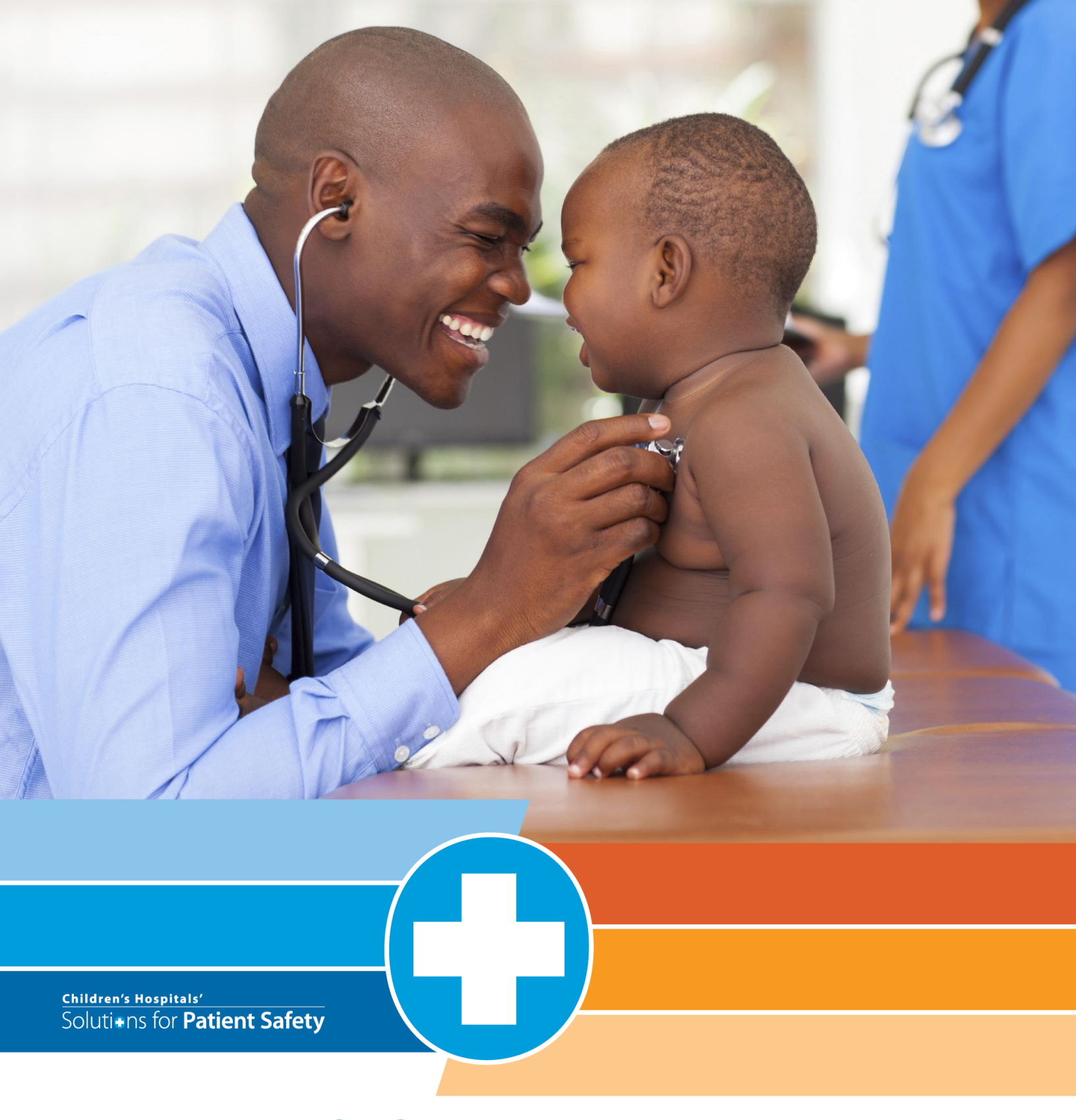
SPS Year in Review